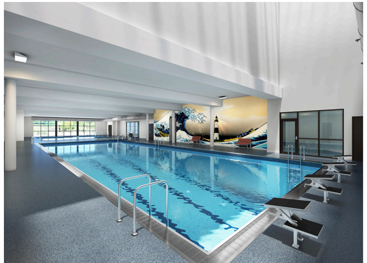
New renderings show what the Montauk Playhouse Aquatic Center, which will have both a lap pool and a therapeutic pool, will look like.