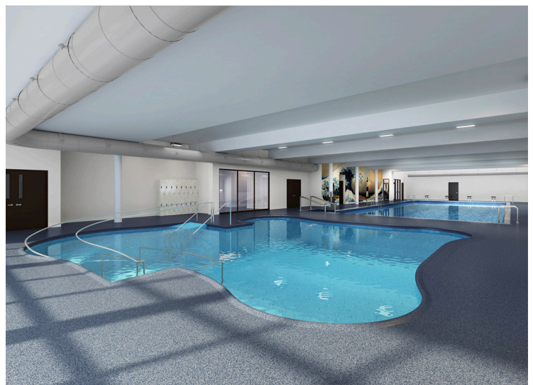
New renderings show what the Montauk Playhouse Aquatic Center, which will have both a lap pool and a therapeutic pool, will look like.