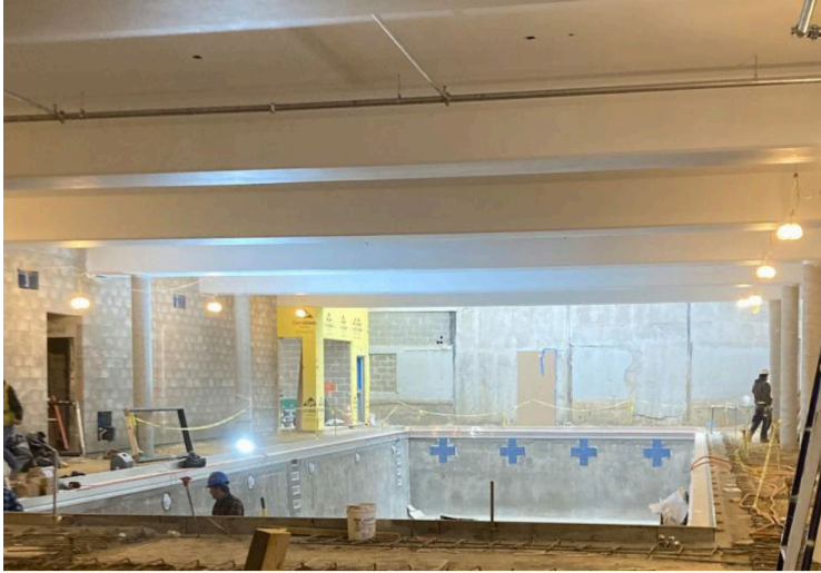
The first dig for the Montauk Playhouse's new aquatic center was in October, now the flooring around the pool is expected to be poured by the end of the week.